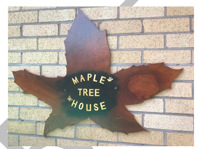
STATEMENT OF PURPOSE

Maple Tree House 110 Merthyr Mawr Road, Bridgend CF31 3NY