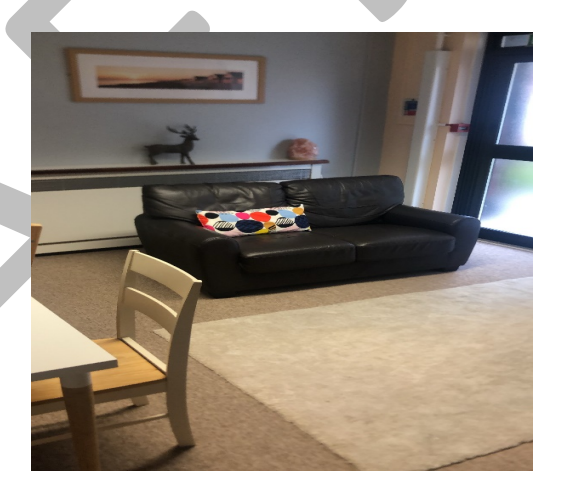
c) Number of communal areas = 5